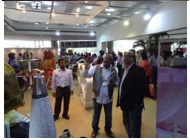
..... the snapshot moments at the Theme Pavilion at IILF 2012.